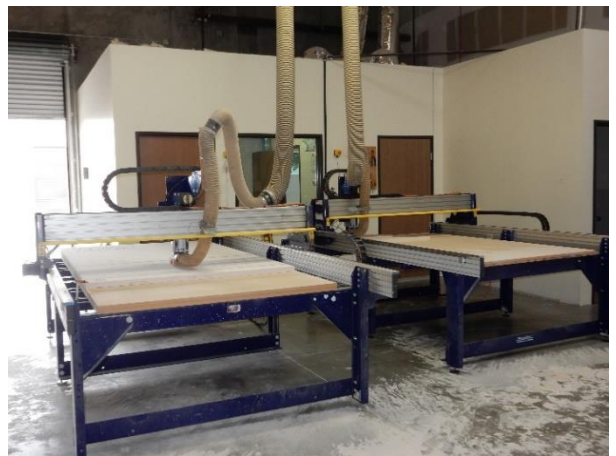
Fig 3 - Two of our five 10 ft x 5 ft CNC Routers

We use a cost and labor efficient computer-aided-design and manufacturing (CADAM) approach that produces very high quality custom signs and plaques that are hand-crafted yet affordable. The current computer design software, along with numerically-controlled machine technology, has resulted in a large increase in productivity and quality, as well as a decrease in cost. We have taken full advantage of this technology by investing over $350,000 in the latest computer and Computer-Numerically-Controlled (CNC) machines and software.