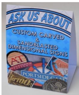
Fig 10- Desktop display