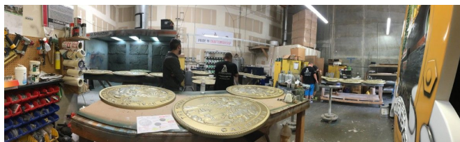
Fig 4b – Spray Paint Shop

Despite this technology, making custom wood and HDU signs and plaques is still very labor-intensive and time-consuming, and requires experienced craftsmen who are expert in woodworking and precision painting, each using a different process, to make our custom signs. Each sign or plaque undergoes 18 to 22 separate operations during its manufacturing cycle. The minimum time to make a sign or plaque, from start to finish, is 15 work days, because we use up to 5 different powered machines, 4 or 5 CNC