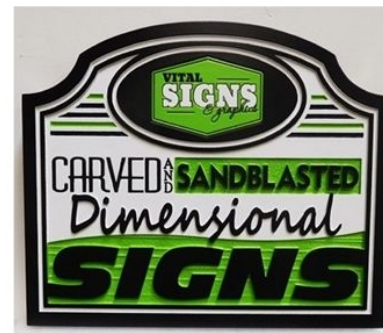
Fig 9 - HDU Sample

to our 15,000 photos of products on our two websites www.artsignworks.com and www.woodmetalplaques.com , and permission to use any of them when you are advertising our products. In addition to these free items, if you wish (it is not required), we will design and make an custom HDU or wood wall plaque with your company’s name and logo or brand advertising “ Carved Dimensional Signs & Plaques”, for a deeply discounted price. Your price for this attractive wall plaque is only $90 for a 24 inch x 18 inch custom carved and sandblasted wall plaque, painted in colors of your choice. (example i Fig 9) Our retail price of this plaque would be $250. Shipping is free. For repeat customers, we provide this sample for free.