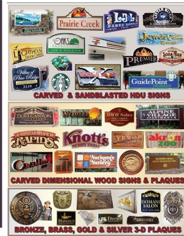
Wall Poster (Unbranded), 22 x 17 Inches