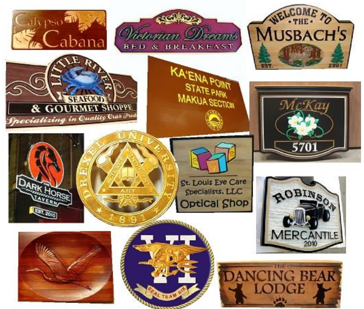
Fig 1 – Typical Signs & Plaques (see Catalog & Website)

distinguished history, going back to ancient Greece and Rome, whose artisans made hand-hewn V-carved engraving and bas-relief sculptures on signs carved in stone. Chiseled engraved wood signs have been hung over sidewalks