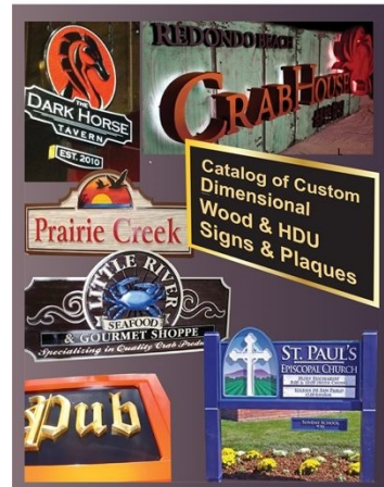
Cover of Unbranded Catalog of Custom Dimensional Signs & Plaques

We will provide you the following;; (1) This Handbook in both electronic and hard-copy form; (2) an unbranded 52 page Catalog of in high-resolution PDF format; (3) the Catalog in hard copy (see Fig 8 or attached download) ; (4) an HDU sign sample that shows various carving and sandblasted styles (see Fig 9) ; and (5) a desktop display advertising“Carved and "Dimensional Signs & Plaques" ,Fig 10); (6) our Wholesale price list.,(7) a 24x 18 inch unbranded wall poster(Fig 8) and (8) access to